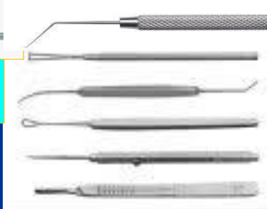
Sinski hook/ Len dialer