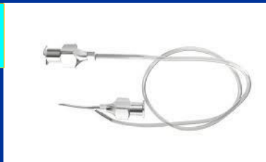
Simcoe cannula OR Irrigation & aspiration cannula