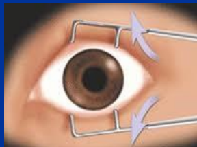
1- Lid speculum